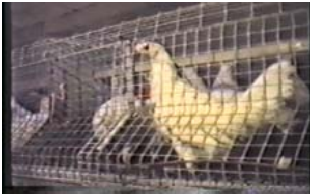
1.5 Million Egg-Laying Chickens Created the best animal testing facility in the world